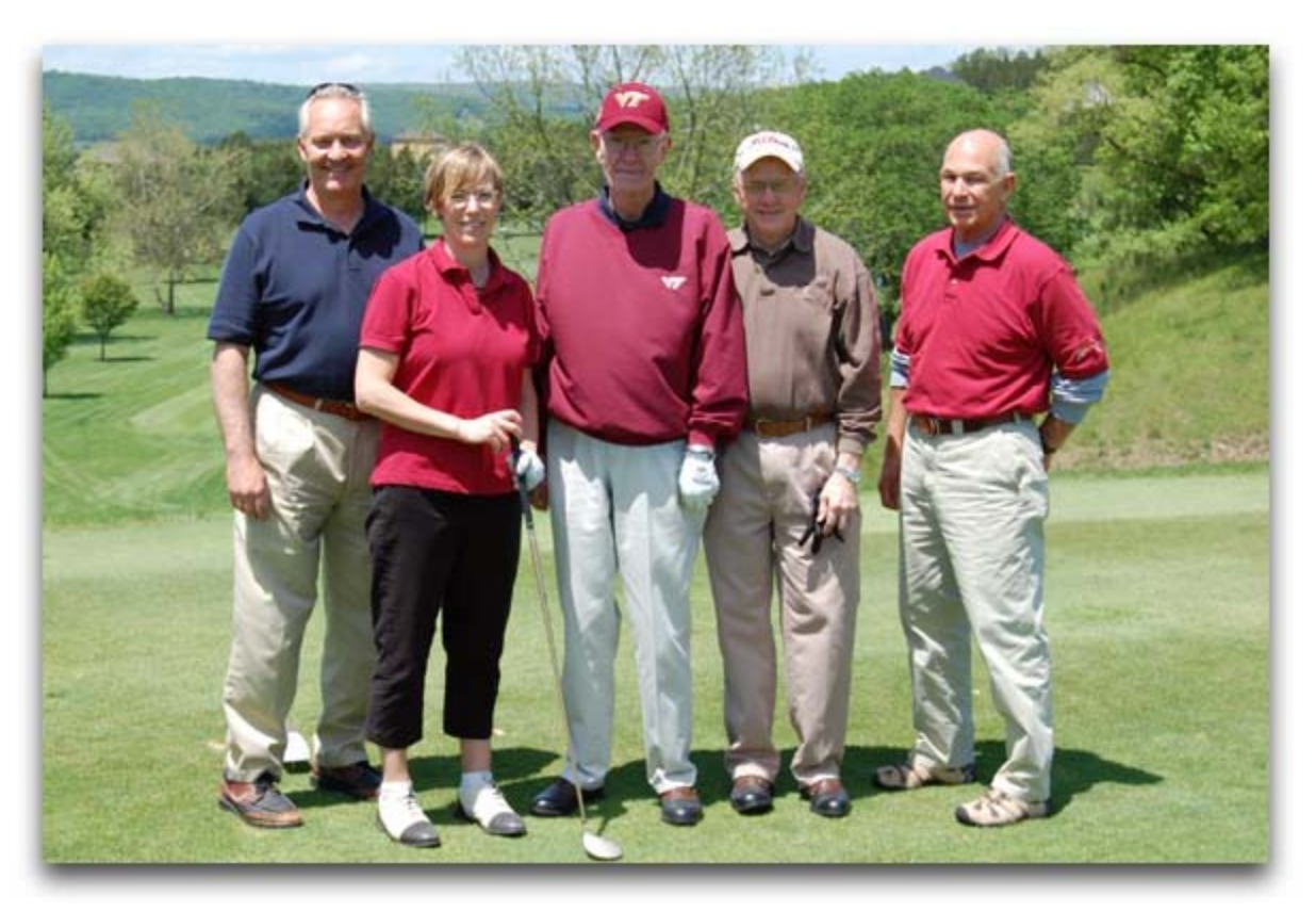
Virginia Tech White