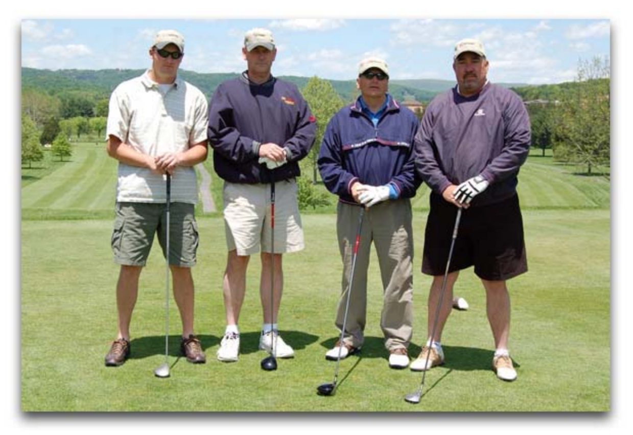
Land O'Lakes Purina Feed