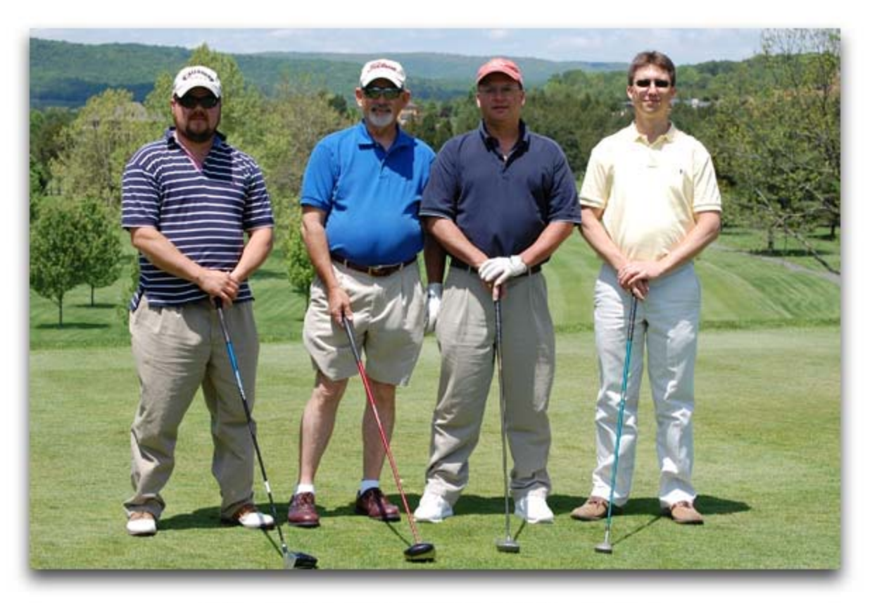
Southern States Maroon