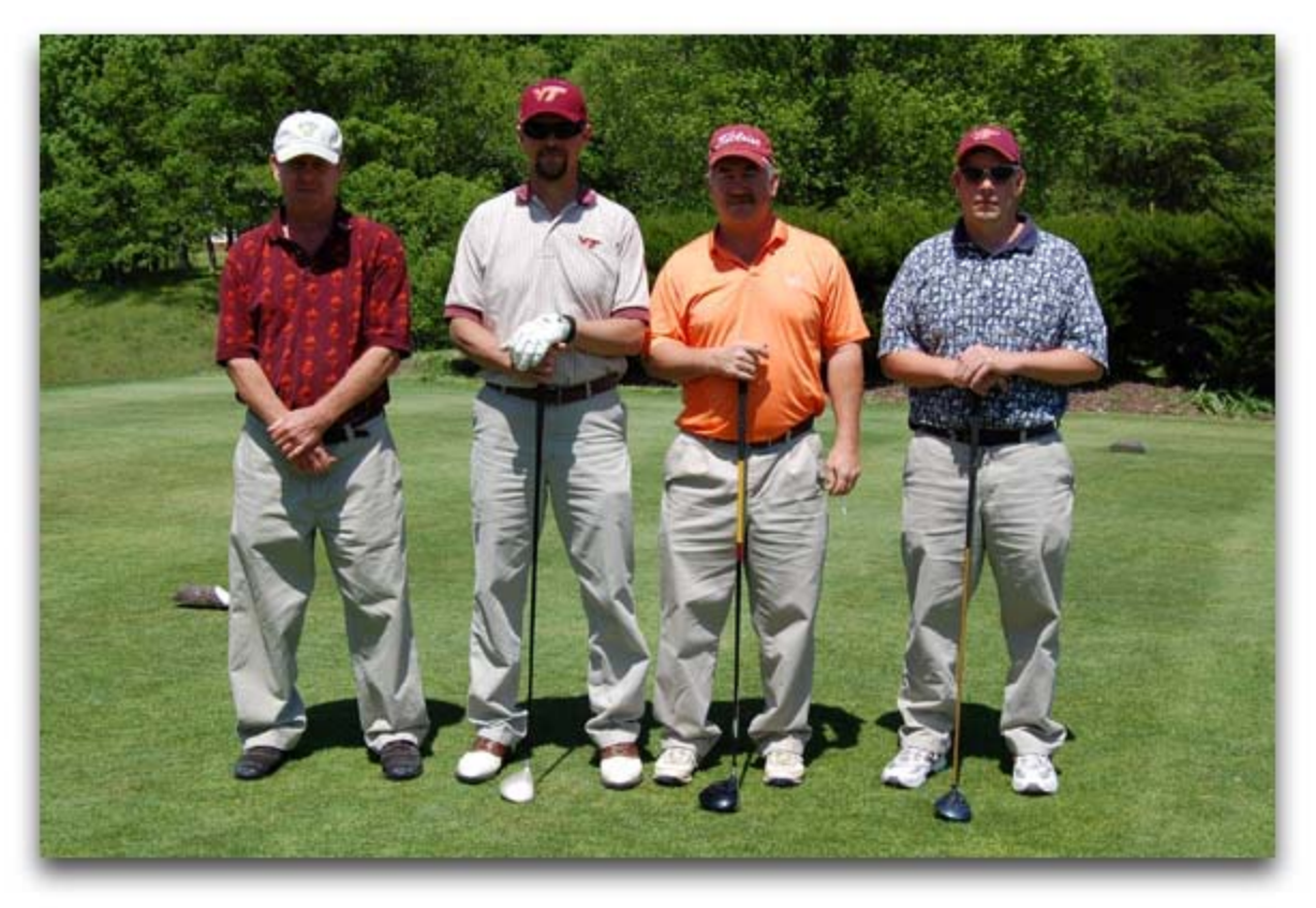
Cooperative Milk White