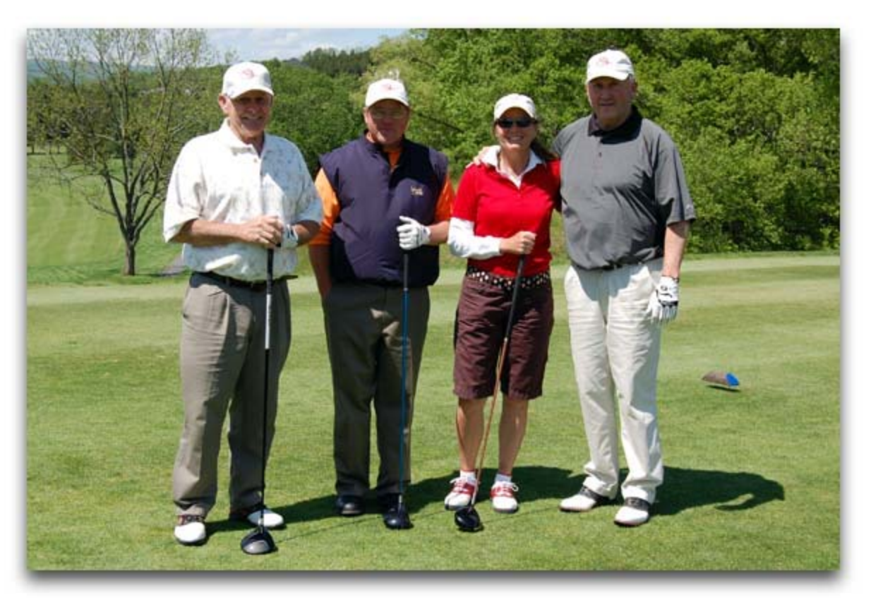
Blue Ridge Embryos