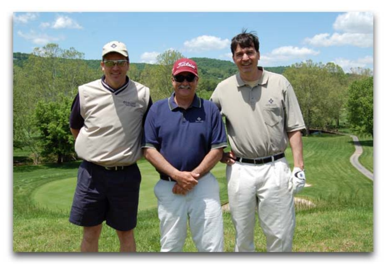
Ag First Farm Credit