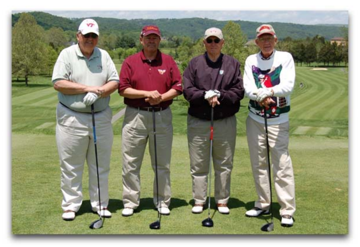
Virginia Tech Maroon