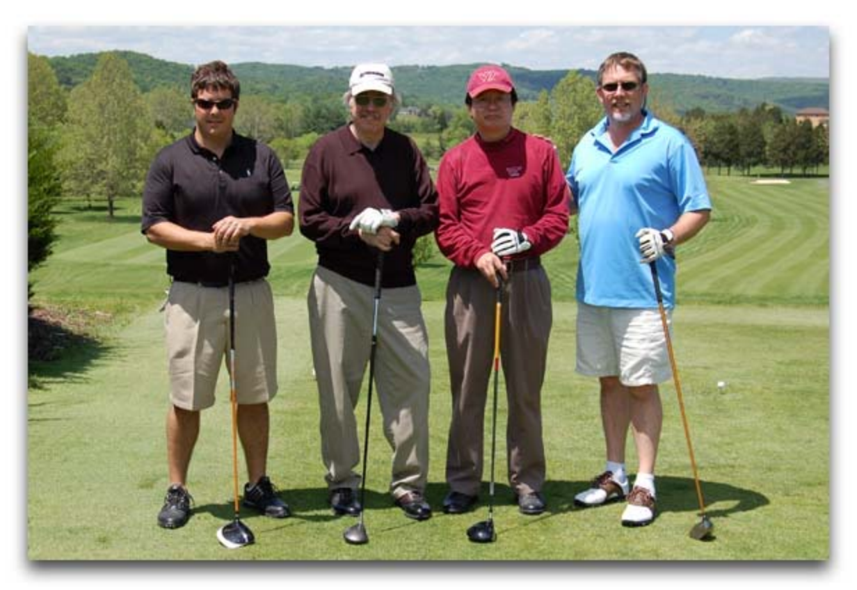
Virginia Tech Vet Med