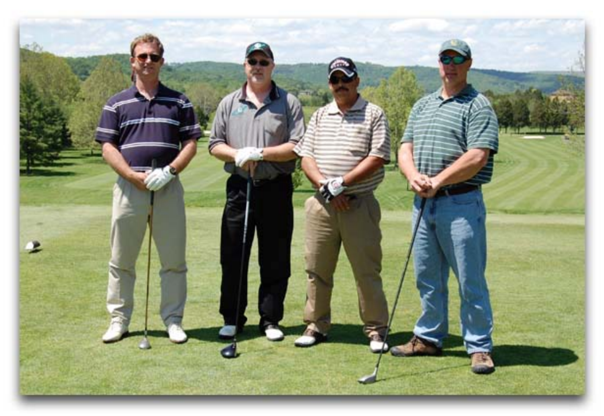
M & K Hoof Care