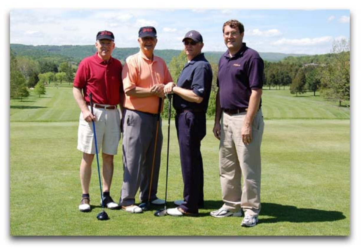
Alltech Biotechnology Center