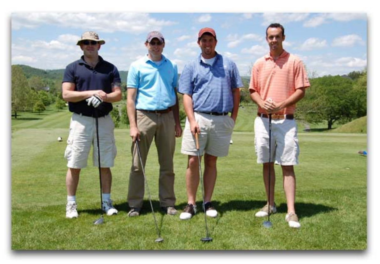
Virginia Tech Orange