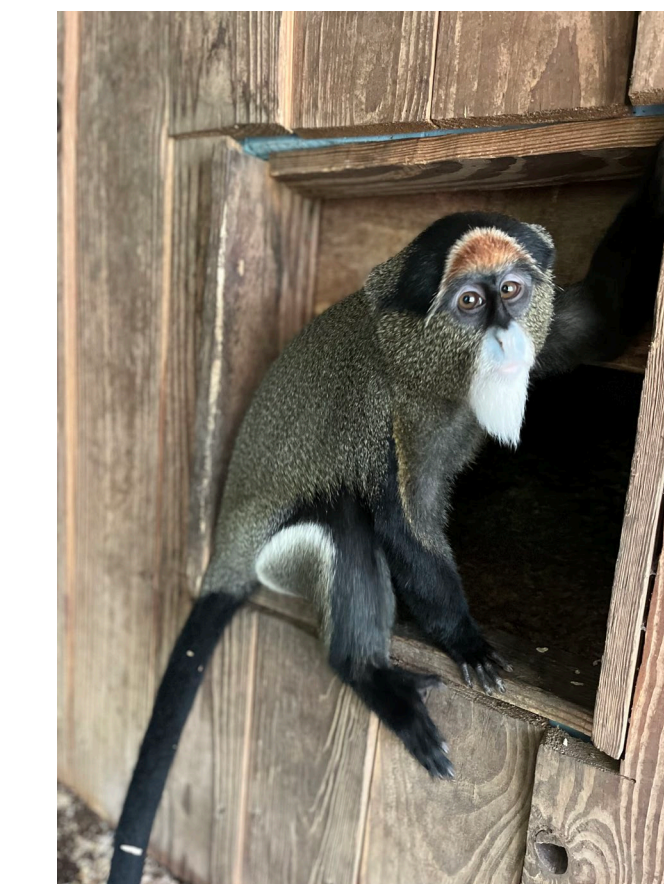
Left: Ring-tailed Lemur , Right: Debrazza Guenon , Middle: Red Ruffed Lemur