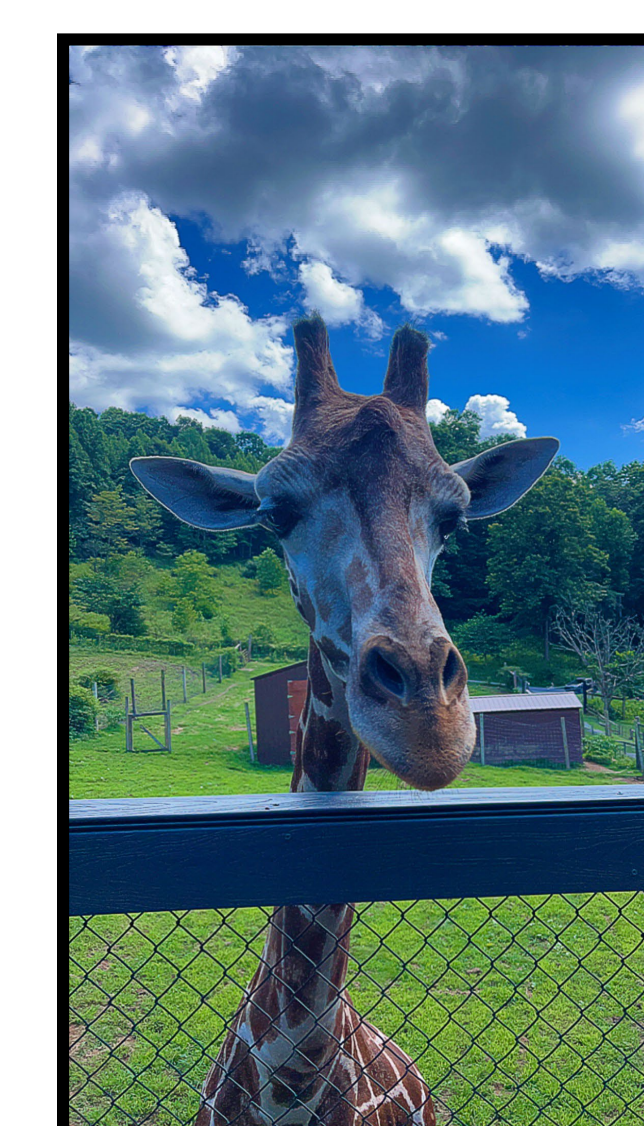
Pictured above: Tucker, their 5-year-old giraffe, enjoying some snacks