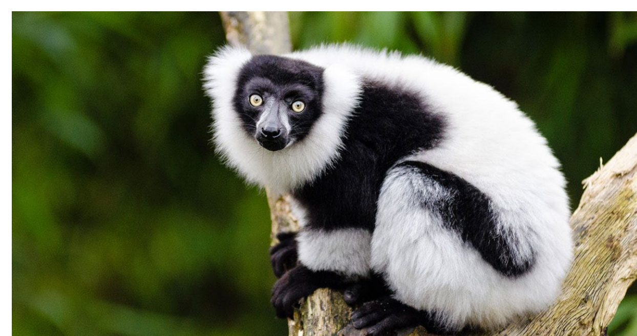
Left: Black and White Ruffed Lemur on my shoulder while I was cleaning their enclosure