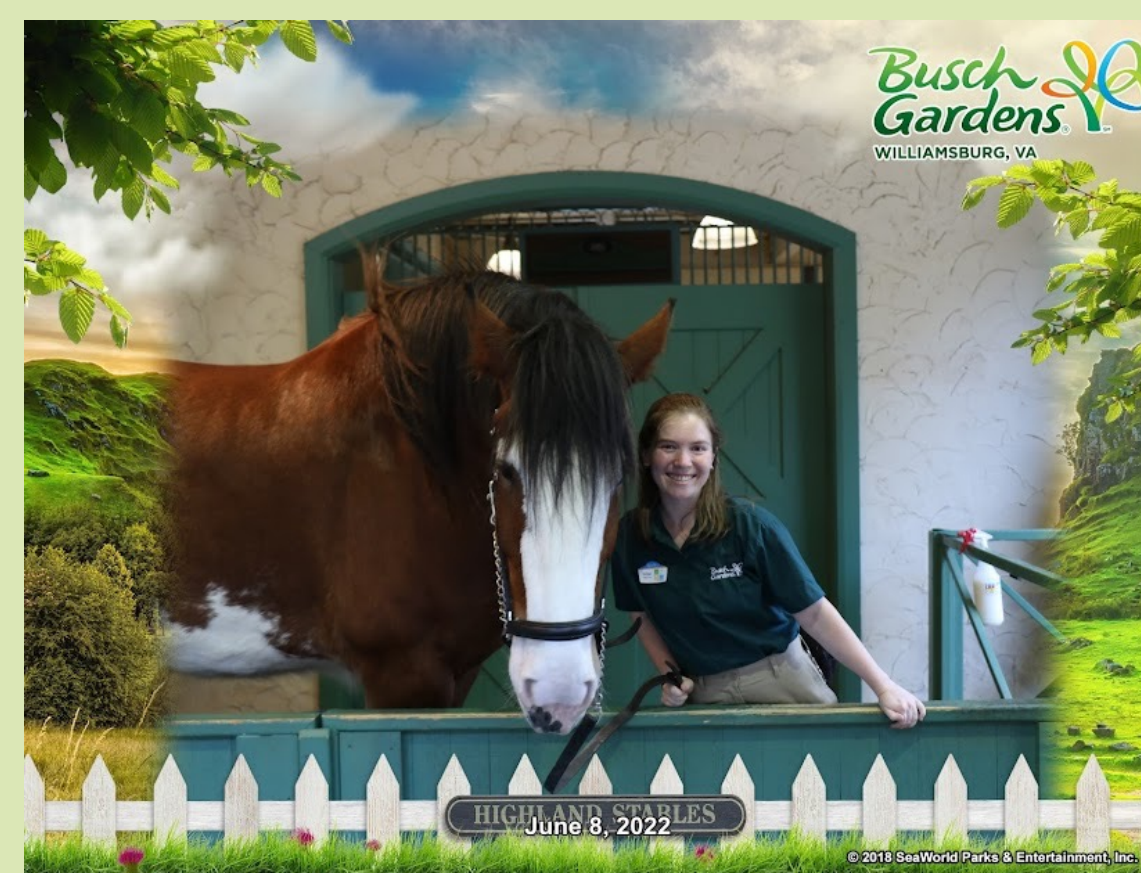
An example of the photos taken with our horses at Clyde Photo

Much of our day involved taking the Clydesdales to Clyde Photo, a photography location where guests can meet the horses and take photos with them. This is an enrichment experience for the horses, and we get to have conversations with people about our horses and other animals. This is a popular interactive experience for the guests.