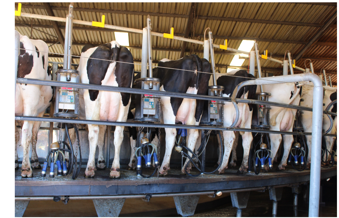
Cows in a dairy farm being milked by a 60-point rotary milking parlor