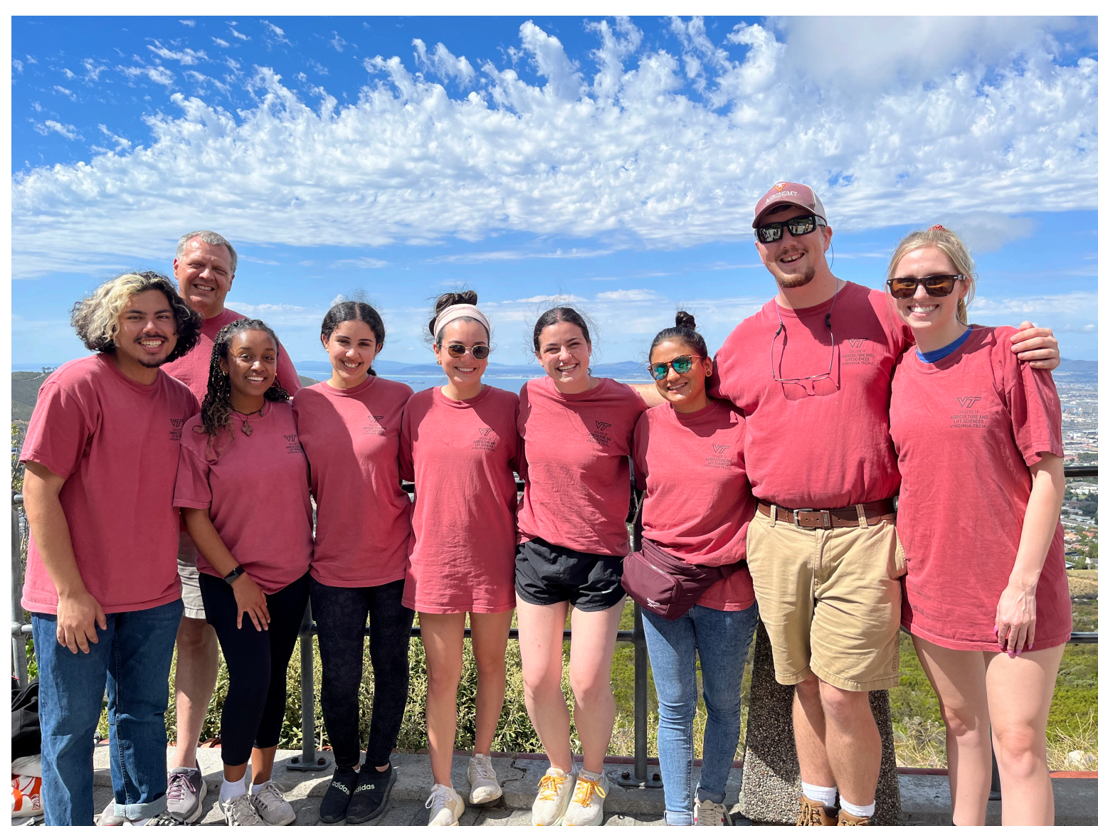
A group of us in Cape Town before we headed up Table Mountain on an aerial cableway

During my trip, I got to visit a lot of different places. I got to stay at a Game Farm and learn about trophy hunting. I got to stay in Kruger National Park and went on Safaris which led me to see some of the Big 5. Next, I was able to visit a diamond mine where the world's biggest diamond was found. For the remainder of my trip, I stayed at Stellenbosch University where I had the opportunity to listen to lectures, visit their Sustainability Institute, and visit places such as a winery, Robben Island, and Cape Town.