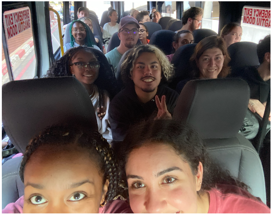
A selfie of us after a 15-hour plane ride. Happy to be on our way to our hotel for dinner and rest!