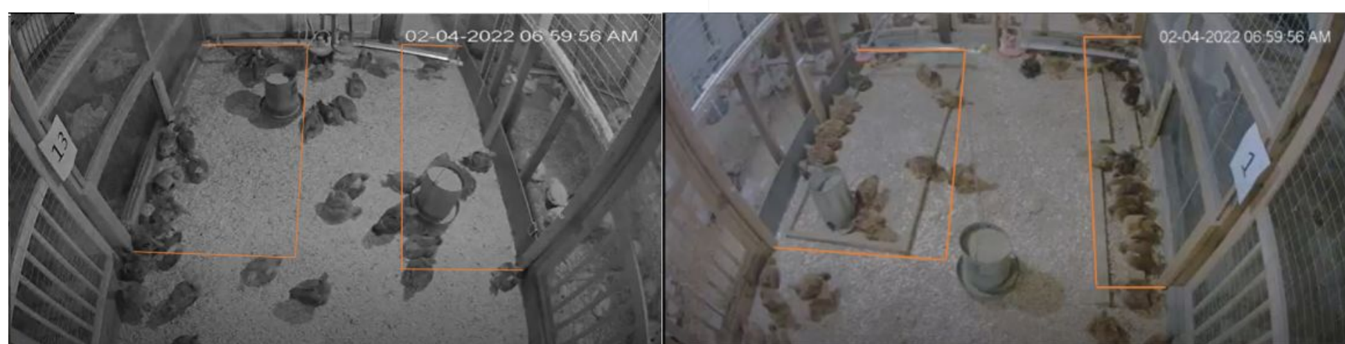
Figure 1. Enrichment zones where birds were counted